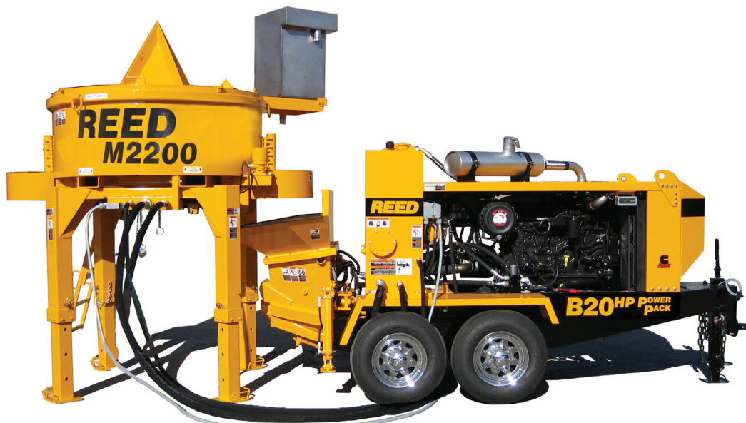
REED M2200 Pan Mixer is capable of mixing much larger loads than the Lift Mixer Attachment (up to 3000 lbs (1360 kg) of Normal Weight Concrete)