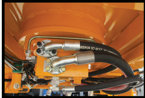
Heavy Duty Hydraulic Motor Drive for M2200 Pan Mixer