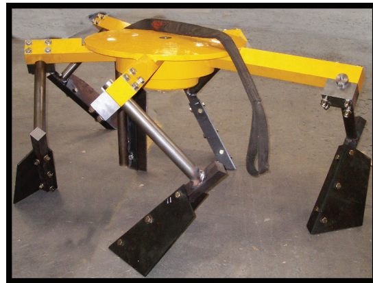
Mixer Blades for M2200 Pan Mixer

M2200 Mixer can also be powered by a "Power Pack Version" of a REED Pump