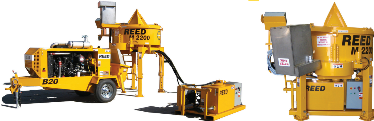
REED M2200 Pan Mixer being powered by the REED P50 Electric/Hydraulic Power Pack (P50 slides under M2200 for easy transport)

For Mixing Shotcrete, Concrete & Specialty Materials