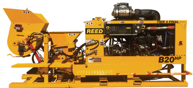
Diesel or Electric Drive Available. Skid or Trailer Mounted Available